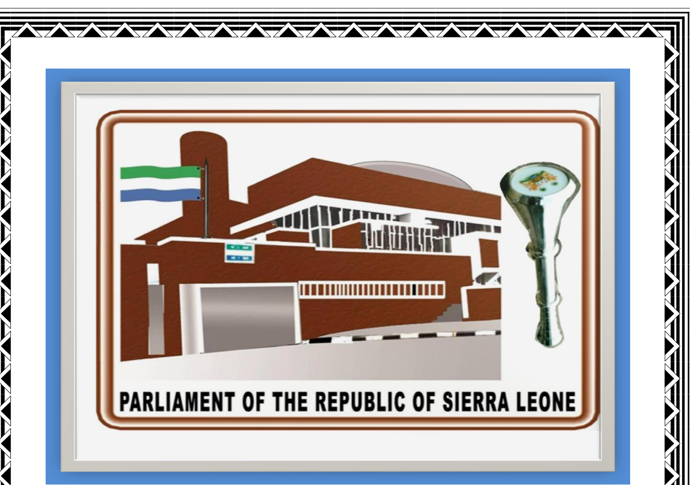
OAU DRIVE, TOWER HILL, FREETOWN